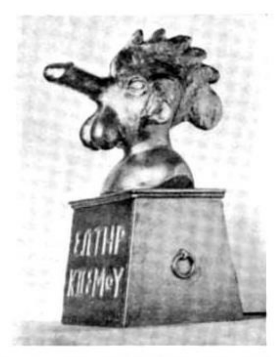
Fig. 257.—The god Priapus as a cock, from a Greek temple.

"The cock was another totemic 'peter' sometimes viewed as the god's alter ego. Vatican authorities preserved a bronze image of a cock with an oversize penis on a man's body, the pedestal inscribed 'The Savior of the World.' The cock was also a solar symbol." [2, p. 79]