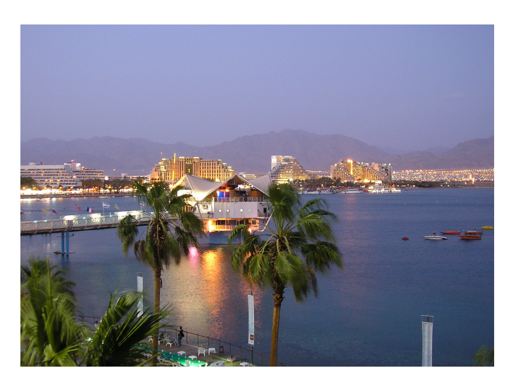
ISRAEL IS A STOLEN CRIMINAL STATE!

And yet, this is a Gentile territory just around the corner, how most of it has looked since the kikes infested: