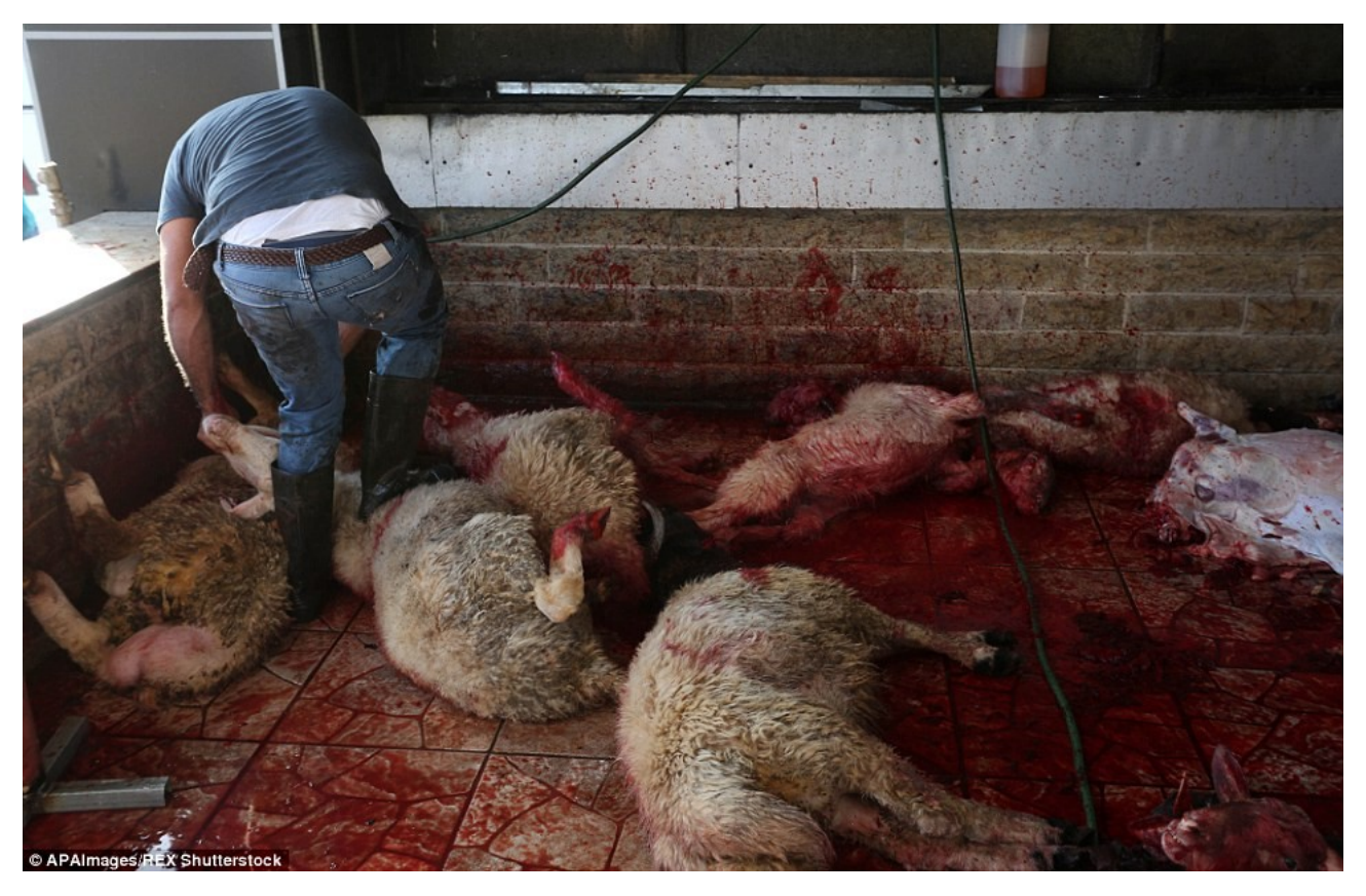
- High Priest Hooded Cobra 666