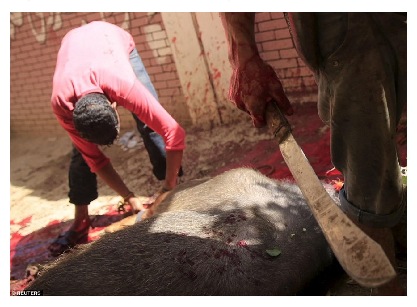
After the act: Two butchers are pictured tending to the carcass of a calf which they just slaughtered in El-Kalubia, Egypt

However, as Ibrahim slashed the throat of his son, he found that an angel had replaced Ishmael with a goat. The animal sacrifices still carried out today are meant to symbolise and celebrate Allah's act of mercy.