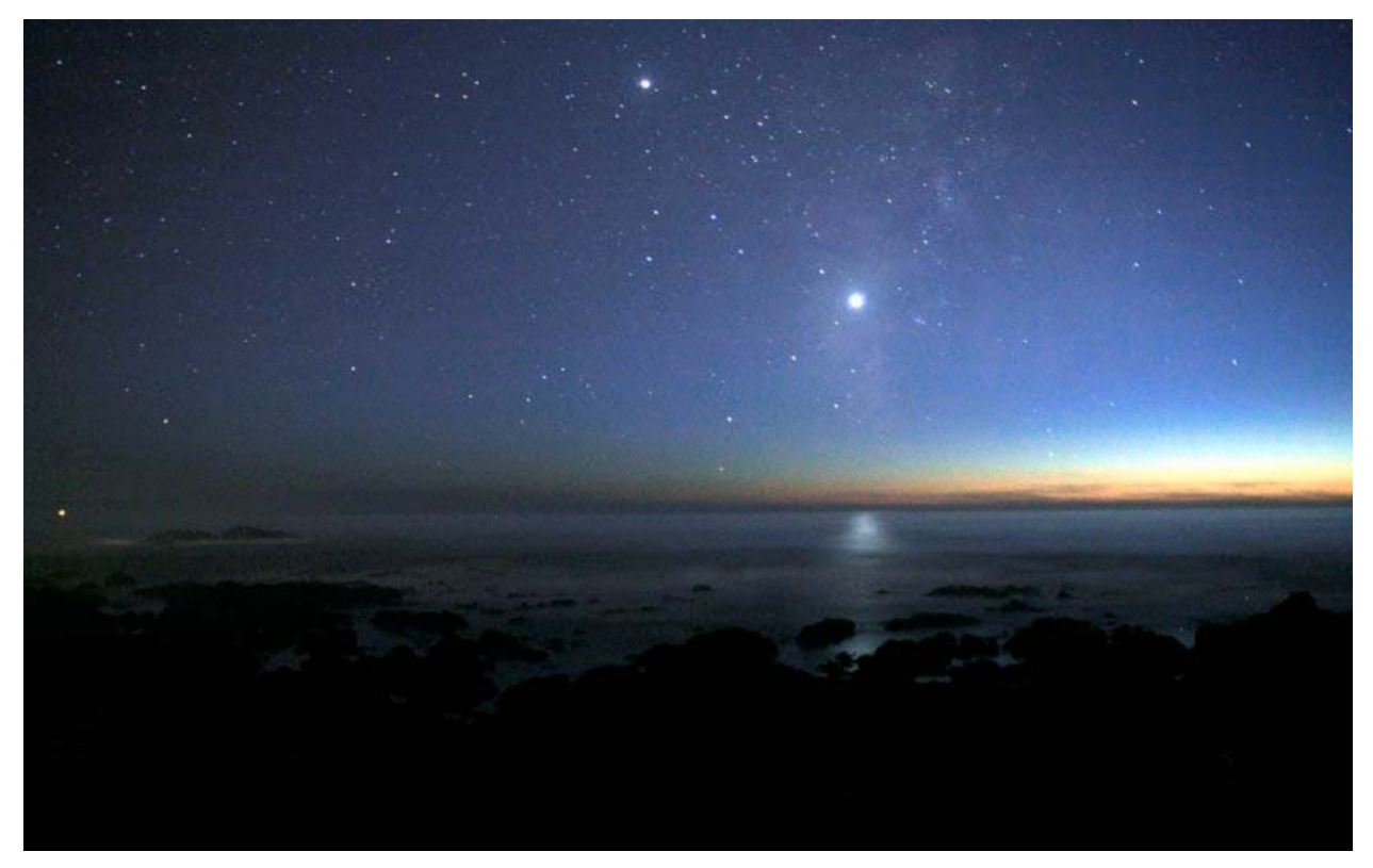
Venus on the horizon.

Uranus is the planet that rules the occult). The LHP is the path of Venus, Sanat Kumara. The pentagram is also the symbol of Venus, the shape of the orbit of Venus and the five is a Venus number. This symbol of Venus would have 666 placed with it to show spiritual rebirth. Venus's number also connect to the Sun. The ankh, the symbol of spiritual rebirth, is the symbol of Venus.