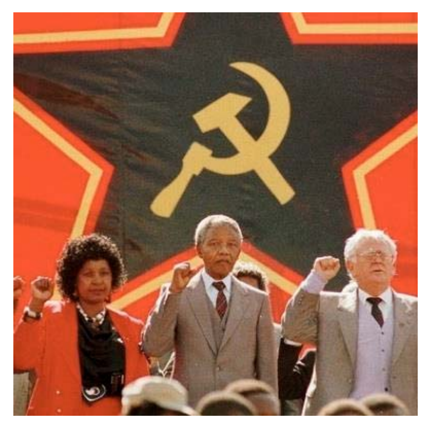
Mandela, the anti-White Communist puppet, standing with one of his jew handlers, Slovo.