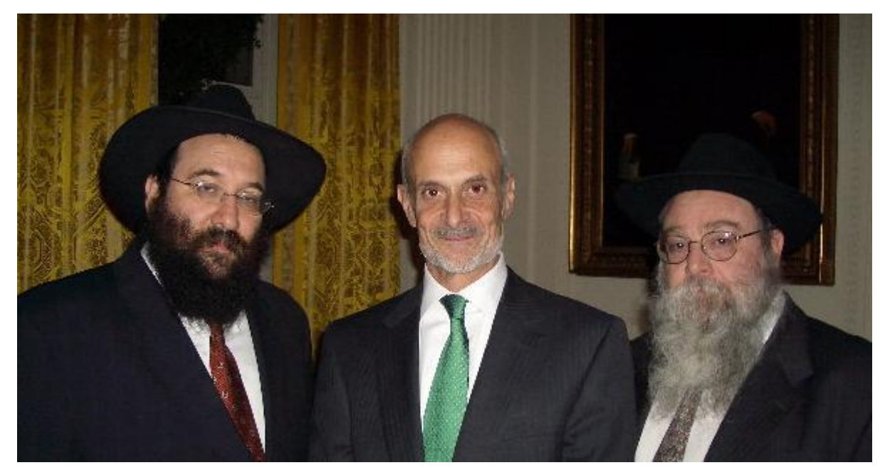
Chertoff Head of Homeland Security and openly Jewish. Chertoff allowed the Mossad agents arrested with connections to the 911 attacks go and run off back to Israel. He also helps run much of the building of the Jewish run surveillance state in America including putting the "prono scanners" of the TSA into existence. The NSA spy grid is all run out of Israel by Mossad front companies.