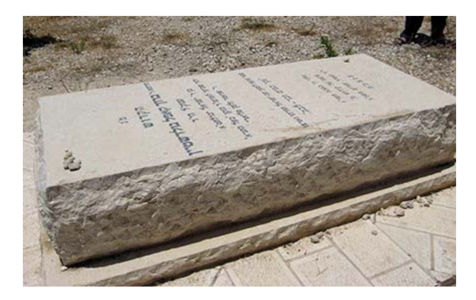
The full article below, from: <a href="http://www.sunray22b.net/baruch_goldstein.htm">http://www.sunray22b.net/baruch_goldstein.htm</a>

The story of the massacre committed by <u>https://en.wikipedia.org/wiki/Baruch_Goldstein</u> in the Patriarchs' Cave in Hebron on February 25, 1994, is well known. Goldstein entered the Muslim prayer hall and shot worshippers mostly in their backs, killing 29, including children, and wounding many more. In this chapter we shall not describe that massacre; rather we shall focus upon Goldstein's career prior to the massacre and upon the reactions of the Israeli government and fundamentalist Jews to the massacre a short time after it occurred. This should provide a vivid illustration of Jewish fundamentalism. We shall extend our discussion of some details until the summer of 1998.