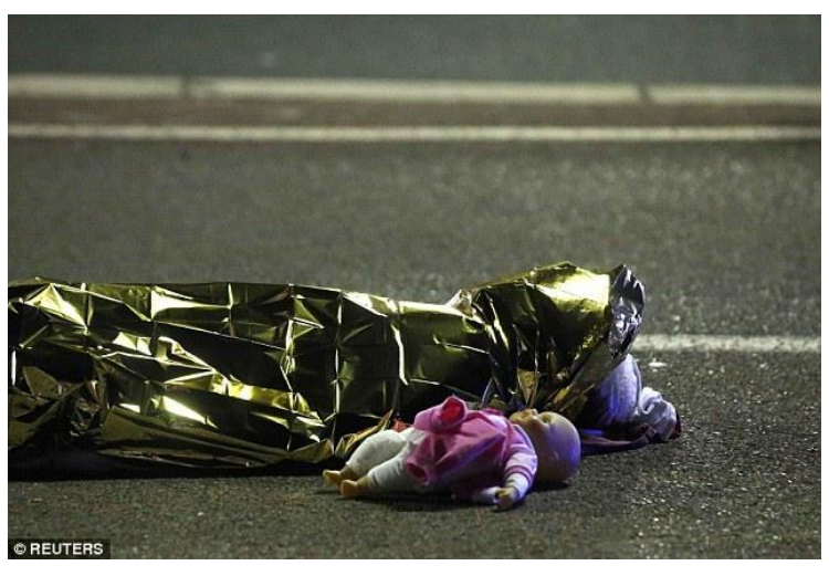
A child's doll lies on the street beside the body of a young girl who was killed in the attack.