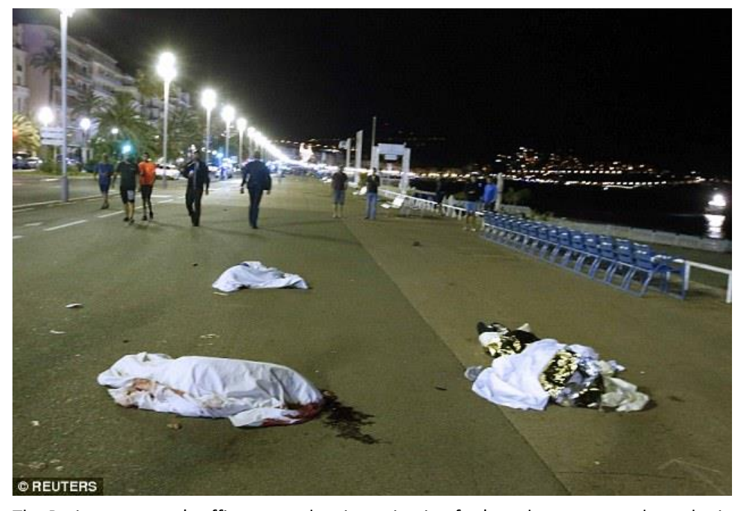
The Paris prosecutor's office opened an investigation for 'murder, attempted murder in an organised group linked to a terrorist enterprise.'