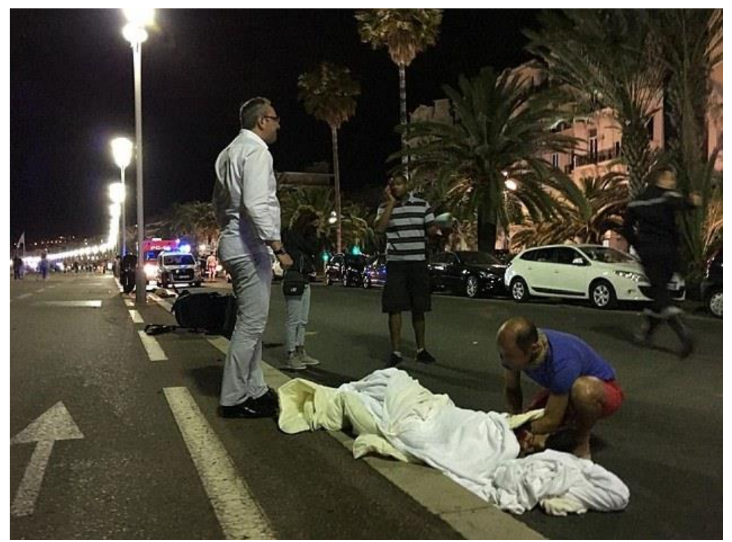
Anti-terrorist police have taken over the investigation into the attack, according to the French interior ministry

Both groups are well known for driving vehicles into innocent people, prompting fears that tonight's incident could be linked to their activities.