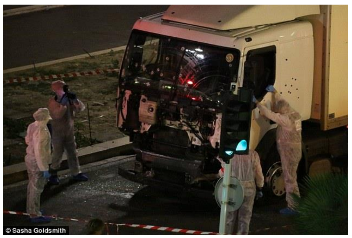
French police riddled the truck with gunfire in an effort to kill the crazed driver, who opened fire after crashing into a crowd of people watching Bastille Day fireworks

One witness called Antoine said: 'We were at the Neptune beach and a firework display had just finished. That is when we saw a white lorry. It was going quickly at 60 kilometers (40 miles) an hour.'