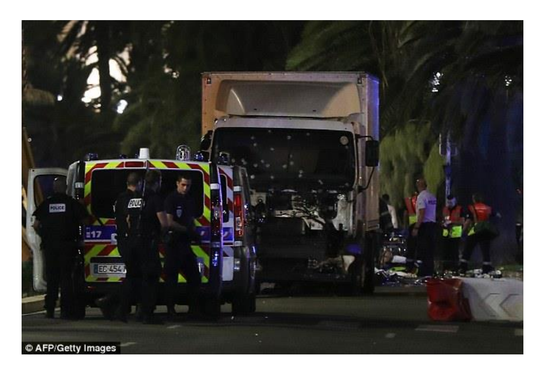
At least 80 people have been killed after a truck ploughed through a large group of people in Nice, France during a suspected terrorist attack.