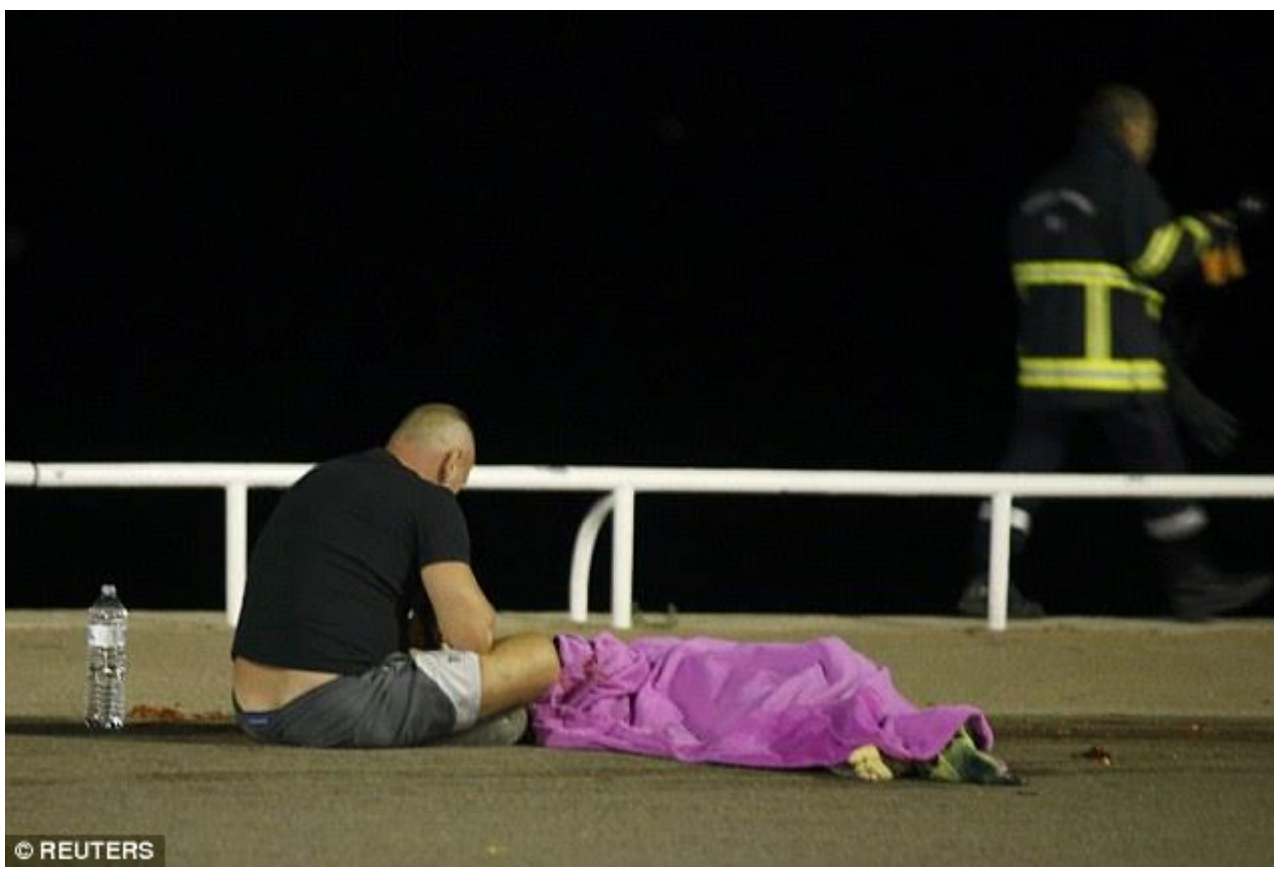
Stunned eyewitnesses prayed over the bodies of their friends and relatives who were killed in the massacre.