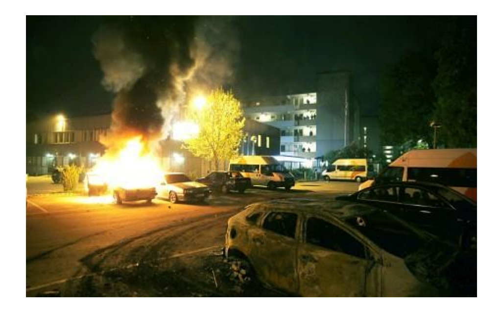
Stockholm riots leave Sweden's dreams of perfect society up in smoke <u>http://www.telegraph.co.uk/news/worldne ... smoke.html</u>