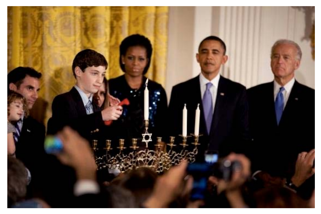
If that's not enough to get it...