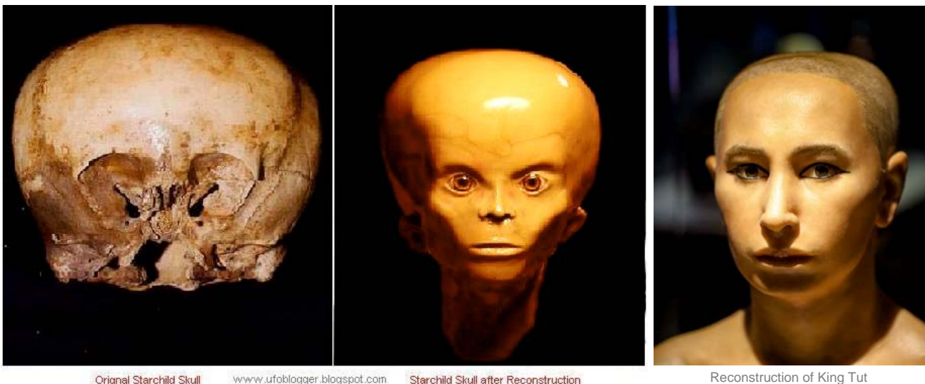
Starchild Skull after Reconstruction Orignal Starchild Skull

If one looks at the images of this skull you can see the truth. Akhenaton was also a Grey-Human hybrid. His son King Tut, who died when he was young, looks identical when put next to the Star Child Skull.