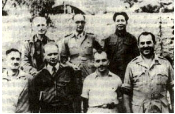
Israel Epstein, second from right in front, standing in front of Mao. He later became of his ministers of state, an extremely powerful position. To the right of him is another Jew, also under cover as a journalist.

Israel Epstein is a naturalized Chinese citizen, and a member of the Communist party of China. He is the Jew responsible for the Cultural Revolution which systematically destroyed Chinese Culture and murdered over five million innocent people. He wrote Mao's little book, which was the premise on which the Cultural Revolution was designed to be waged on the Chinese population