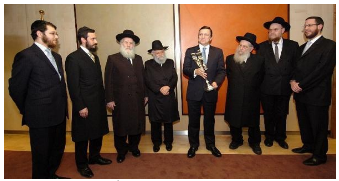
Barros Former PM of Portugal. Another nation controlled by Jews