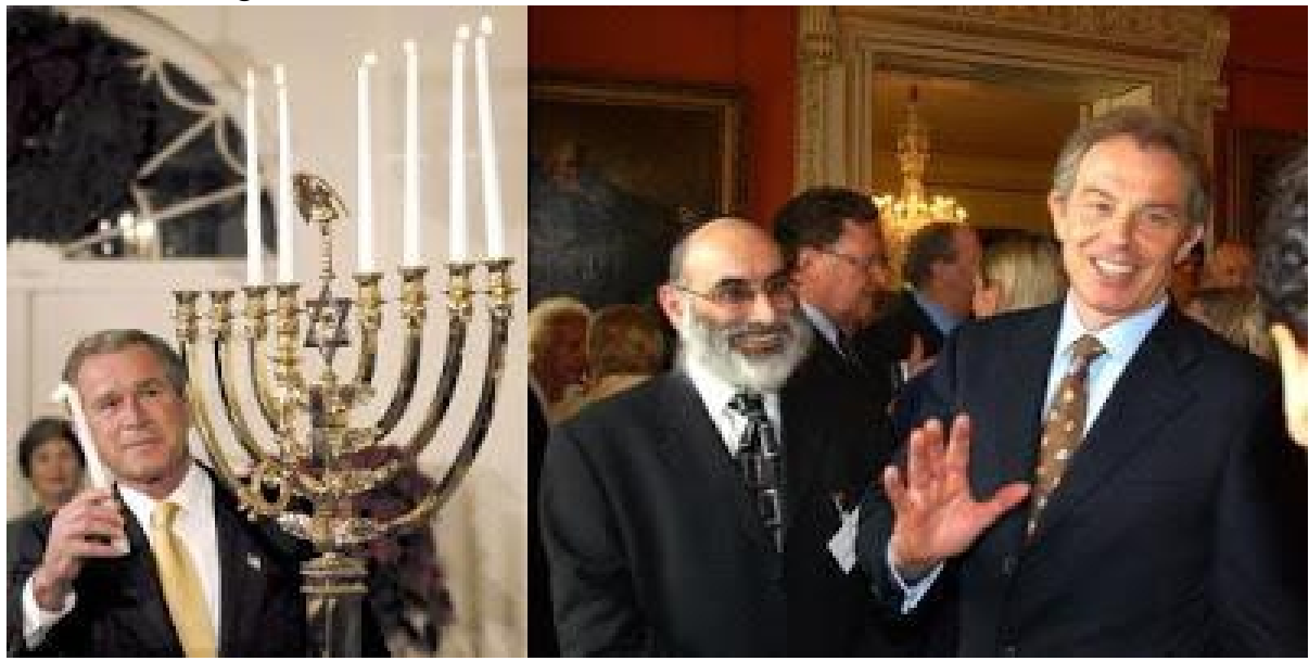
The entire British ruling and Political class is controlled by Jews and Pedophilia as the Jimmy Seville scandal revealed.