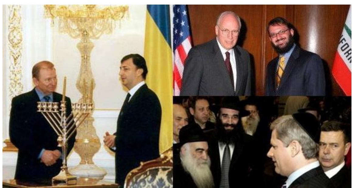
The Ukraine, Harper, and Cheney.

The Ukraine is being controlled by the Jewish IMF and Jewish Oligarchs. The Jews want to regain control in the Ukraine and use control of both Russia and Ukraine to incite a Third World War.