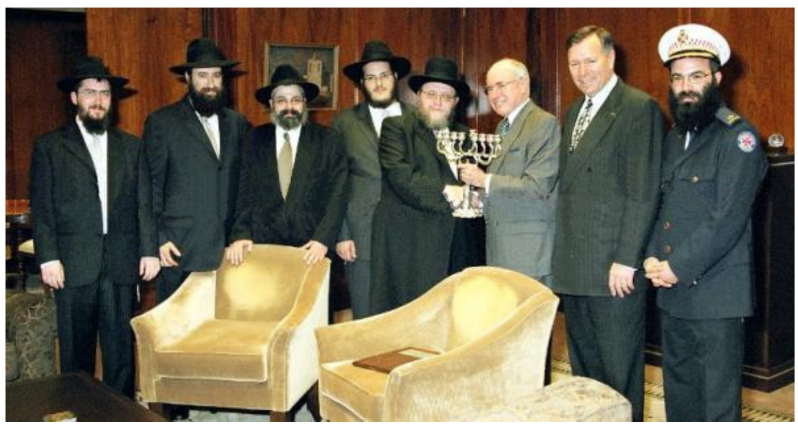
John Howard, Prime Minister of Australia. Controlled by Jews