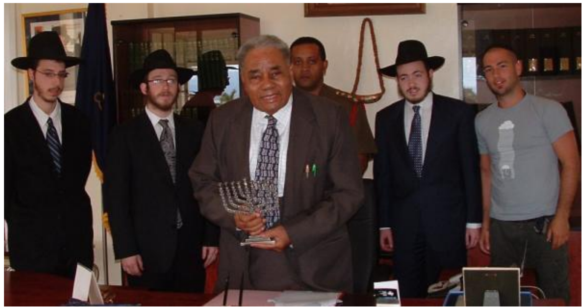
lloilo, President of Fiji. Even Fiji is not exempt from Jewish control