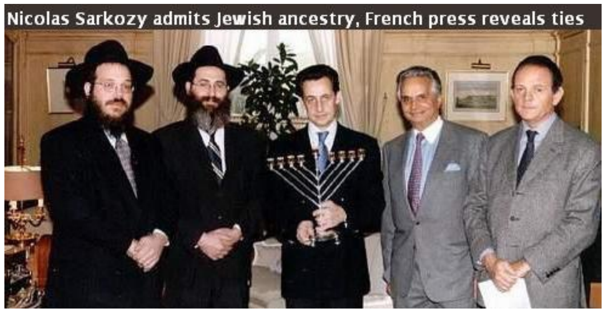
Openly anti-European, Jewish, former French President Sarkozy. How do you think France got full of all those brown Muslim People who blow stuff up and shoot hundreds of people?