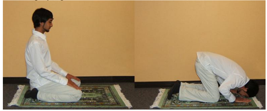
Matches with Vajrasana