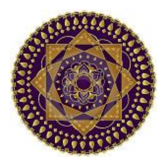
Hindu Mandala depicting the 8 pointed Star of Goddess Lakshmi