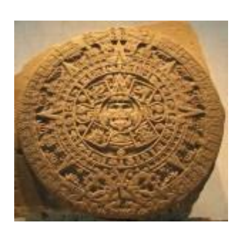
Ancient Aztec Caldendar-note the 8 rays

The 8 pointed star is a Pagan Symbol that was associated with great power throughout the Ancient World. It was the symbol of the Goddess Inannna/Astaroth and also the symbol of Venus. It represents the Heart Chakra, the powerhouse of the Soul, in its empowered state when it radiates eight rays, connecting all 13 Major Chakras of the Soul.