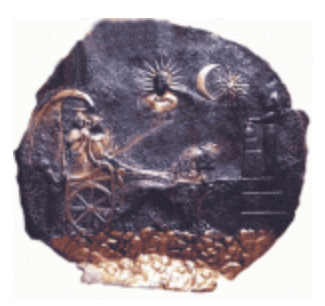
Ancient Babylonian Depiction

It is obvious that this symbol did NOT originate with islam. The Symbol of the Crescent Moon and Star is extremely Ancient and was present in every Ancient Pagan Culture of the world. It is a very powerful and important Alchemical Symbol, relating to the Third Eye and Sixth Chakra as well as to the Feminine Aspect of the Soul.