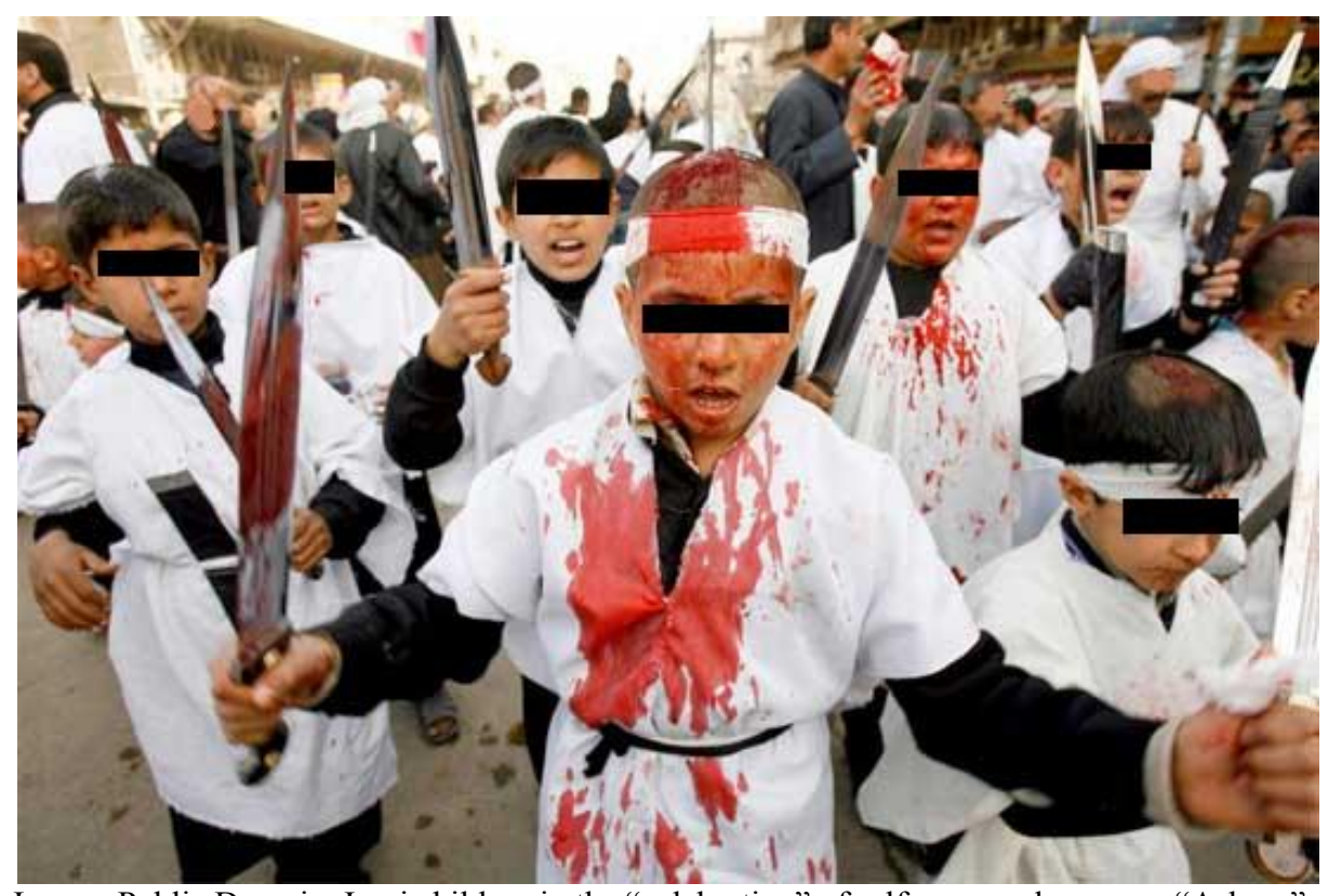
Image: Public Domain. Iraqi children in the "celebration" of self-scourge known as "Ashura".