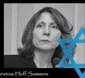
Christina Hoff Summers