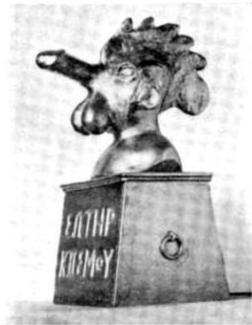
Fig. 257.—The god Priapus as a cock, from a Greek temple.

"The cock was another totemic 'peter' sometimes viewed as the god's alter ego. Vatican authorities preserved a bronze image of a cock with an oversize penis on a man's body, the pedestal inscribed 'The Savior of the World.' The cock was also a solar symbol." [2, p. 79]