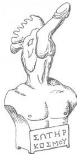
Bronze sculpture hidden in the Vatican treasury of the Cock, symbol of St. Peter. Inscription reads "Savior of the World."

"On this stone, which was the emblem of the male generative principle, the Linga, Jesus founded his church. This sacred stone is found throughout all the world. In India at every temple. The Jews had it in the stone of Jacob, which he anointed with oil. The Greeks, at Delphi, like Jacob, anointed it with oil. The black stone was in the Caaba, at Mecca, long before the time of Mohammed... Mr. Bryant says, 'When the worship of the sun was almost universal, this was one name of that deity, even among the Greeks. They called him Petor, and Petros, and his temple was styled Petra.' Where the temples had this name... there was generally a sacred stone which was supposed to have descended