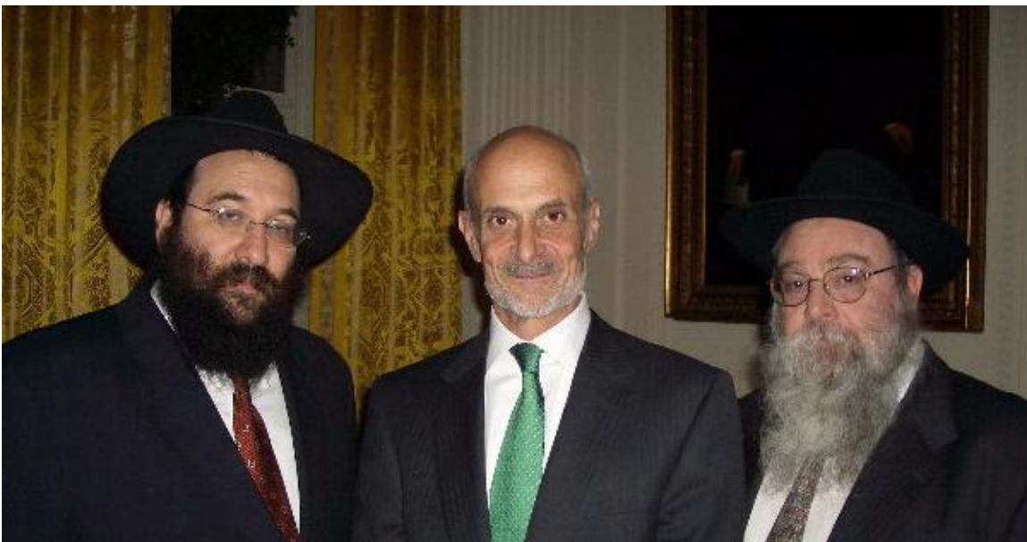
Michael Chertoff, Head of Homeland Security and openly Jewish. Chertoff allowed the Mossad agents who were arrested because of their connections to the 9-11 attacks, go and run off back to Israel. He also helps run much of the building of the Jewish-run surveillance state in America, including putting the "prono scanners" of the TSA into existence. The entire NSA spy grid is controlled and operated out of Israel by Mossad front companies.