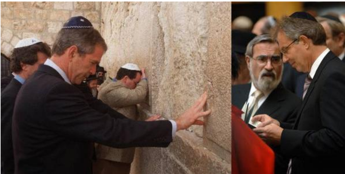
Bush praying at the Wailing Wall and PM Tony Blair with Brittan's Chief Rabbi