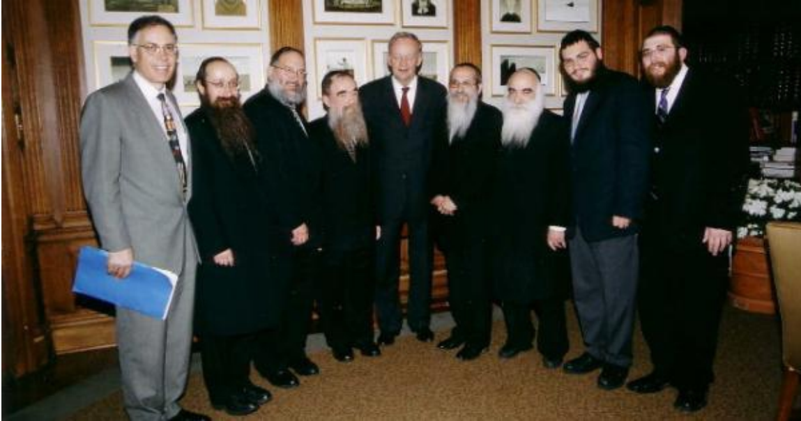
Prime Minister of Canada Jean Chrétien. The new Liberal PM, Trudeau who Chrétien served under his father, before becoming PM. The Entire campaign was financed by the Jewish billionaire Bronfman family. The Jews also funded Harper in the same election.