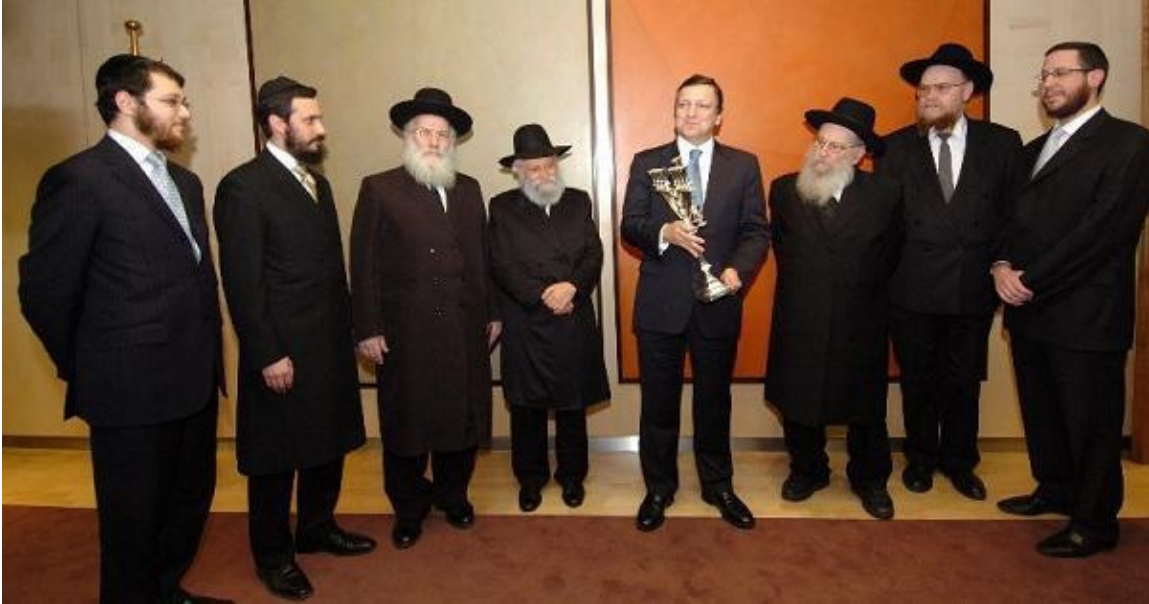
Barros Former PM of Portugal. Another nation controlled by Jews