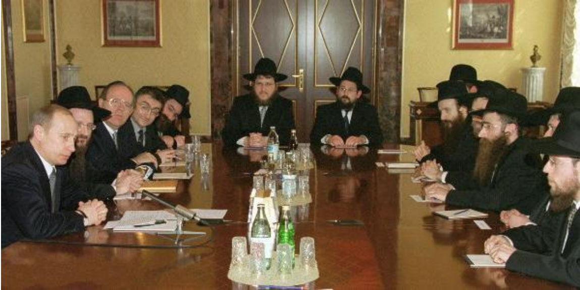
Vladimir Putin President of Russia