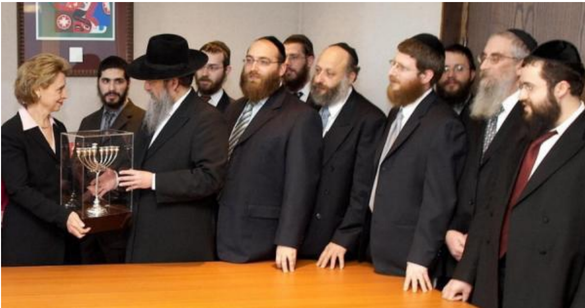
Hillary Clinton is Jewish from her Rodham side of the family. You can see the Jew genes in her daughter.