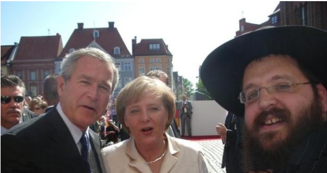
Bush and German Chancellor Angela Merkel [Kantor] Merkel is Jewish, her family surname means “Kantor” in English, from Polish before being Germanized later, “Kantor” is a rabbinical name.