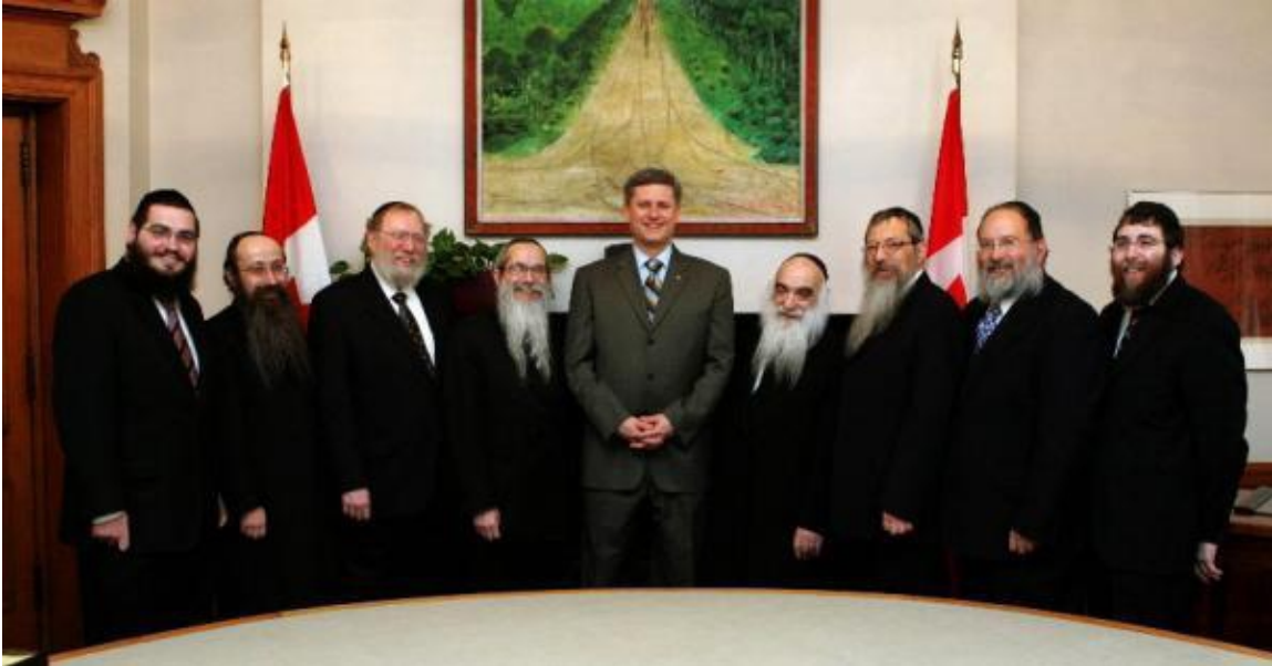
Harper Prime Minister of Canada, the B'nai B'rith is right across the road from his party office in Albert. The Jewish Press of Israel praised him as "the biggest ally of Jews ever."