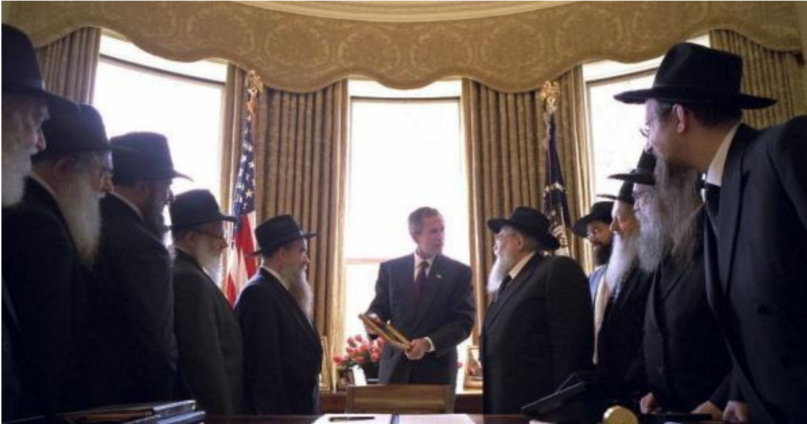
George Bush President of America. Early census records in America listed the Bush family as Jewish. The Jewish Harriman dynast built them into powerful family