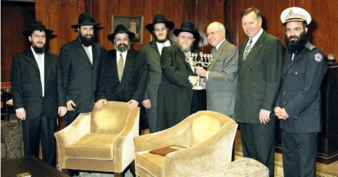
John Howard, Prime Minister of Australia. Controlled by Jews