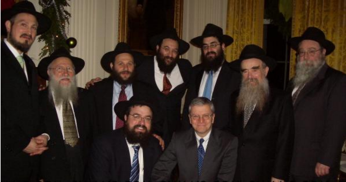
Joshua Bolten Chief of Staff