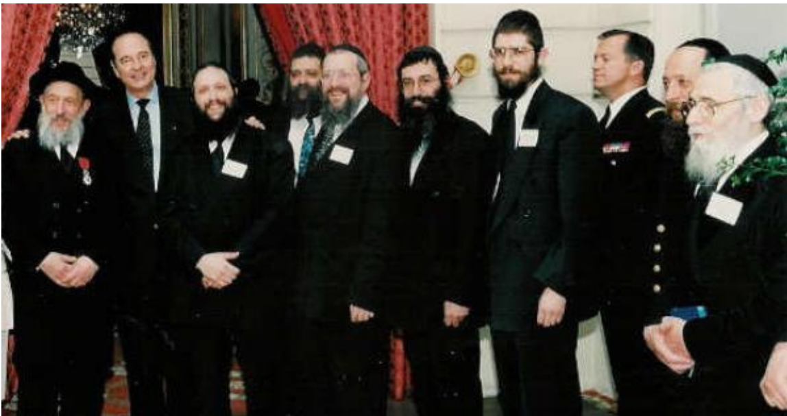
The President of France Jacques Chirac. Sarkozy was an open Jew who called for the White French to be raced-mixed out of existence. However, how many French Prime Ministers are even Gentile? Or does it even matter anymore?