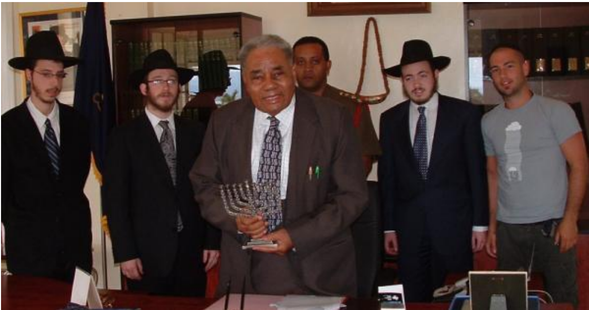
Iloilo, President of Fiji. Even Fiji is not exempt from Jewish control