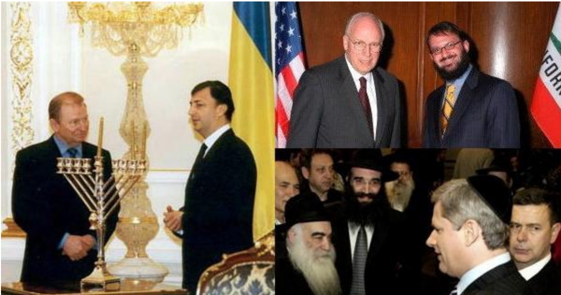
The Ukraine, Harper, and Cheney. The Ukraine is being controlled by the Jewish IMF and Jewish Oligarchs. The Jews want to regain control in the Ukraine and use control of both Russia and Ukraine to incite a Third World War.