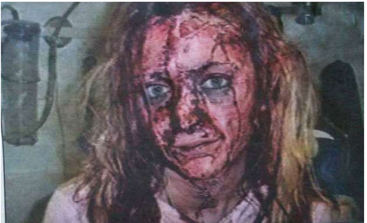
Female victim of a Muslim rape gang in Sweden one of thousands.

https://www.youtube.com/watch?v=wb_4U2UJucE