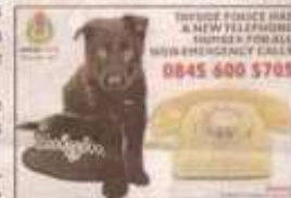
Card: The police mailshot

Tayside Police said they chose the image of Rebel in light of the puppy's popularity with online users - his blog has attracted thousands of visitors.